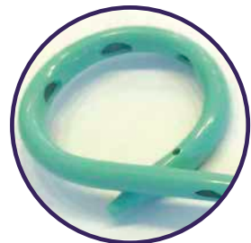
Tapered pigtail tip with 4 oval holes