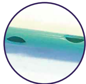
Hydrophilic polyurethane stent with 8 oval holes